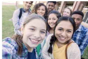
Teens at the heart of our actions

Foster the development of skills like self-affirmation, selfcare and care for others among teens, and making informed choices about their sexual health.